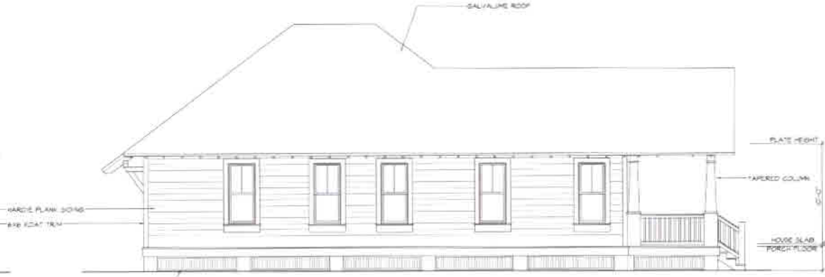
4 SIDE ELEVATION A2-1 SCALE 1/4" = 1'-0"

THESE PLANS AND ALL DRAWINGS CONTAINED ON THIS SHEET ARE OWNED BY ARCHISCAPES, LLC. UNAUTHORIZED REPRODUCTION AND USE OF PLANS IS STRICTLY PROHIBITED.