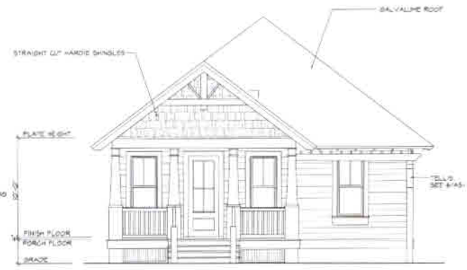
2 FRONT ELEVATION A2-1 SCALE 1/4" = 1'-0"