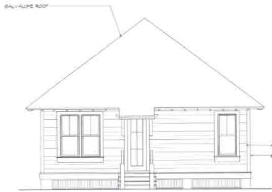
3 REAR ELEVATION A2-1 SCALE 1/4" = 1'-0"